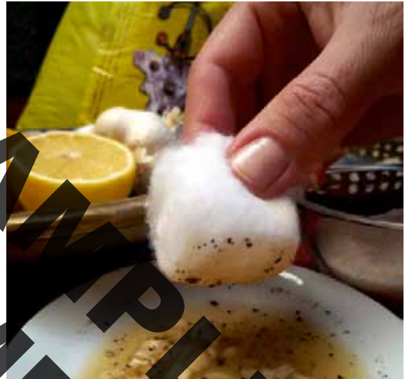
Garlic and pepper are added to lemon and sugar to make a mixture called sqiya that is dabbed onto the henna after it is applied.

In Morocco, henna paste is made with henna powder (of course), hot water, and sugar; sometimes