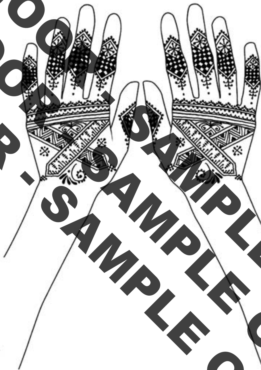
Simple design using overlapping shapes, by Kenzi.